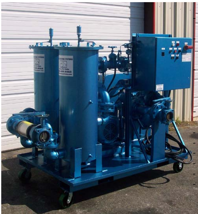
400 GPM Portable Filtration System

The harmful effects of particulate contamination in hydraulic, lubrication, and fuel oils have been well documented. Oil Filtration Systems, Inc. has developed a line of High Flow Portable Oil Filtration Systems to quickly and reliably remove particulate contamination from a variety of fluids, enabling end-users to extend the life of component parts, reduce maintenance costs and down-time, and maximize profitability. These systems are portable, and can be used for fluid transfer, high velocity oil flushing, or off-line kidney-loop filtration. Filter elements are available in a wide variety of micron sizes and media types to handle virtually any application.